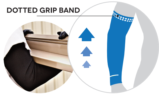
DOTTED GRIP BAND

No more slipping! Sleeves with arm openings featuring "STAYz-Up" technology hold up—comfortably gripping onto underlying fabric or skin to ensure sleeves stay in place, and keep you protected no matter what. Unlike other products on the market, we won't let you down.